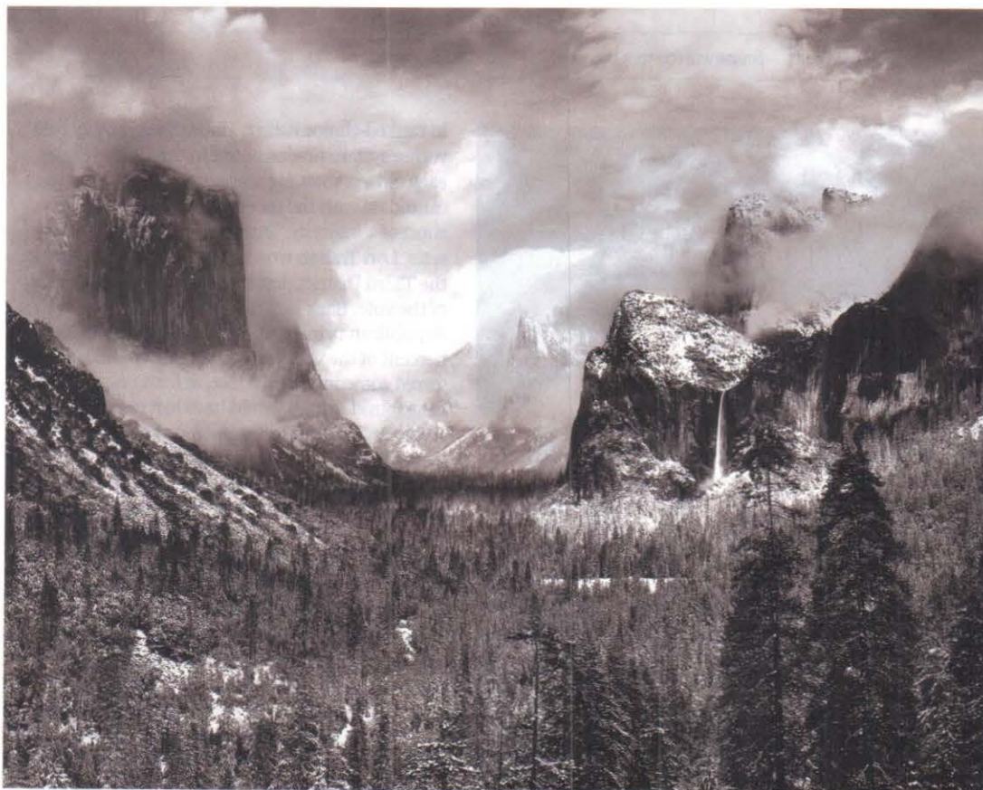
Ansel Adams, Clearing Winter Storm, Yosemite National Park , about 1937.